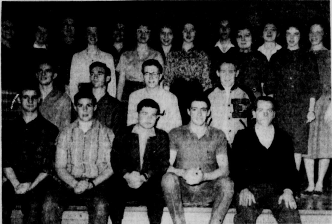
JUNIOR PLAY CAST—"Curtain Going Up", a three act comedy, will be presented Friday at 7:30 p.m. in the high school auditorium. Members of the cast are pictured above.