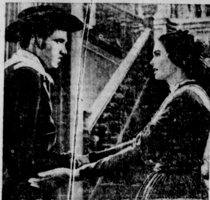
Jimmie Rodgers bid farewell to his former Southern sweetheart (Linda Hutchings) after making the difficult decision to join the Union forces in the celebrated classic "The Little Shepherd of Kingdom Come," 20th Century-Fox CinemaScope DeLuxe Color release also starring Luana Patten, Chill Wills. Thursday, Friday and Saturday at the Majestic Theatre in Eastland.