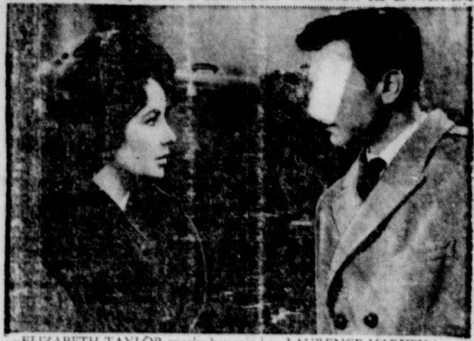
ELIZABETH TAYLOR speaks her mind to LAURENCE HARVEY in MGM's "BUTTERFIELD 8", dating CinemaScope and color drama.