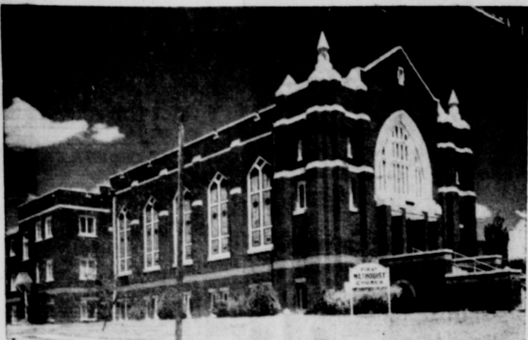
First Methodist Church . . . Organized in 1876, the First Methodist Church, located at 215 South Mulberry Street, was completed in 1928. The first unit of the present church was built in 1919.