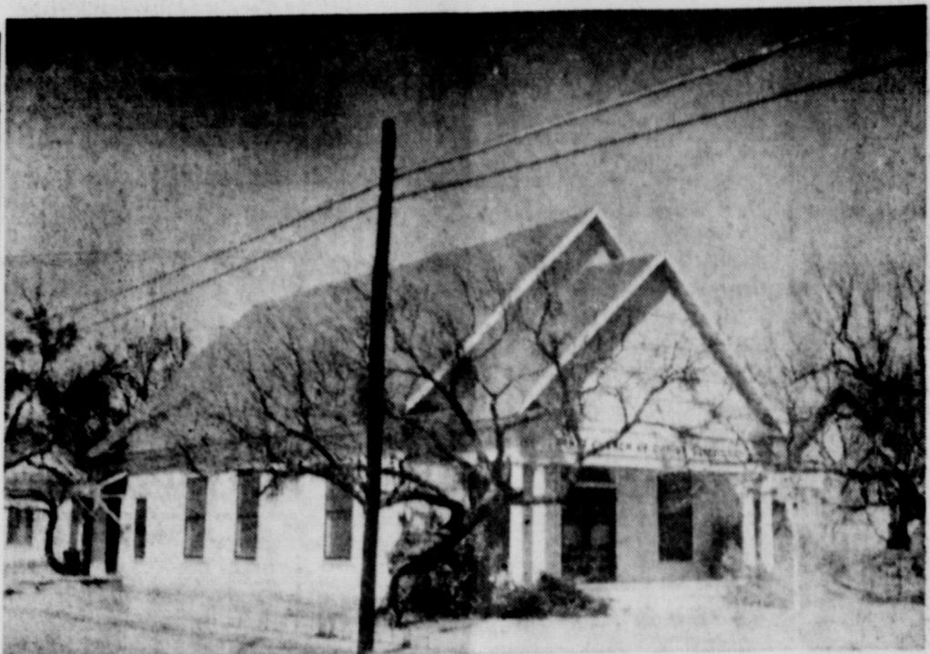
First Church of Christ, Scientist -- Christian Science services were first held in Eastland in 1908. The present church location on the corner of Lamar and Plummer was purchased in 1916 and during the years has been remodeled and refurnished.