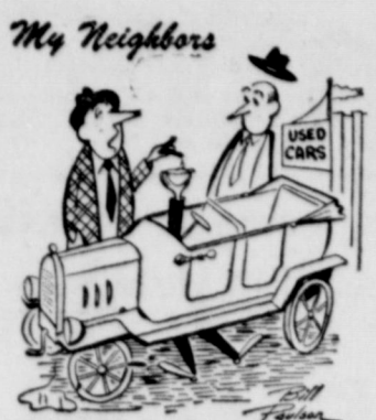
"Now here's a feature not found in most cars...POWER ASHTRAYS!"