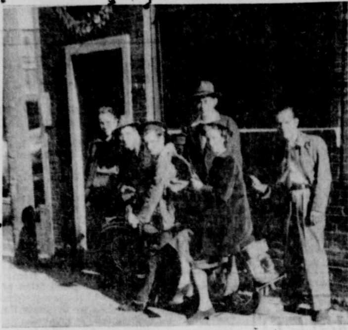
DO YOU REMEMBER?—Motorcycle fun on the streets of Eastland was the hit of the day when this picture was made. Do you remember these people? Actually it hasn't been too long ago. The Telegram would be happy to hear from readers who think they can identify the people in this picture. There are no prizes, just a lot of fun playing the "remember when" game.