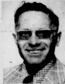
By Clint Bray

Firm convictions are what we have the moment we learn what view the boss takes on the matter.