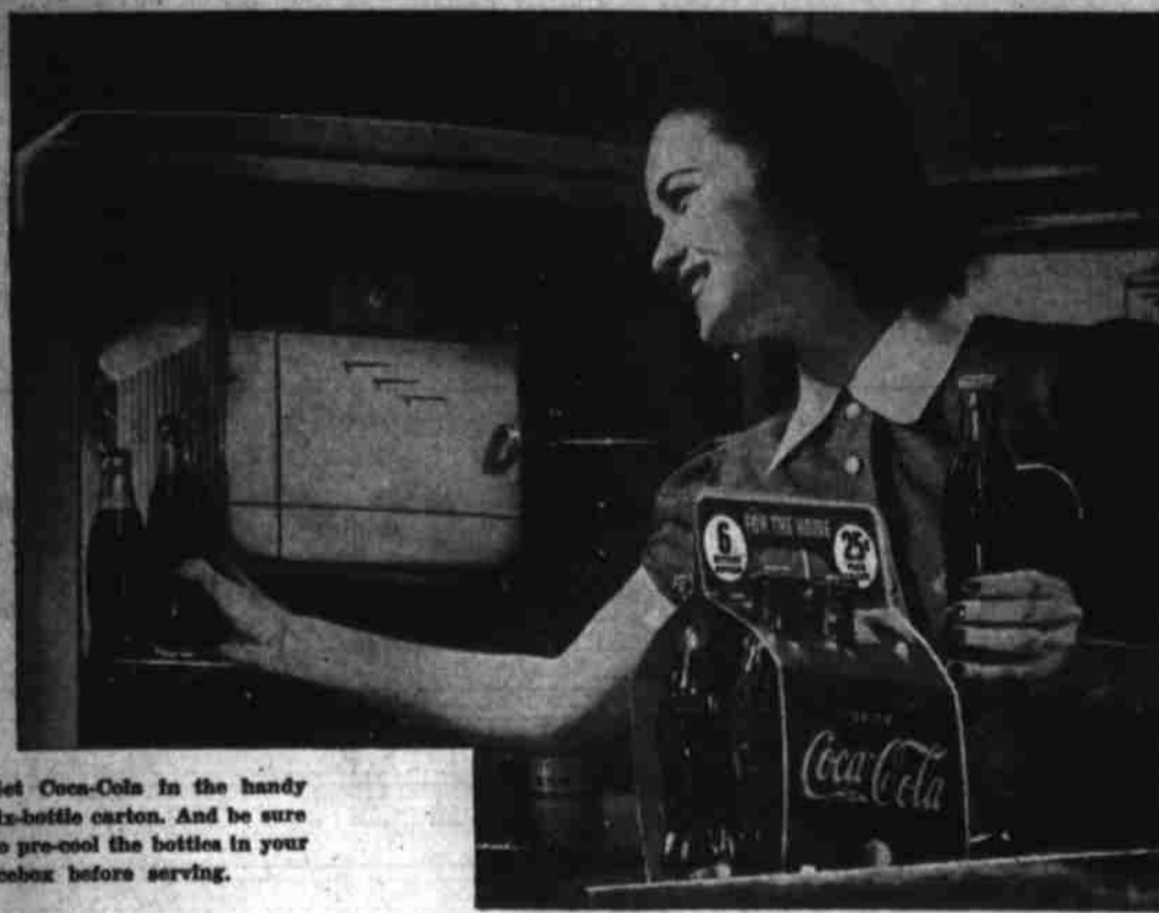
Get Coca-Cola in the handy six-bottle carton. And be sure to pre-cool the bottles in your freezer before serving.