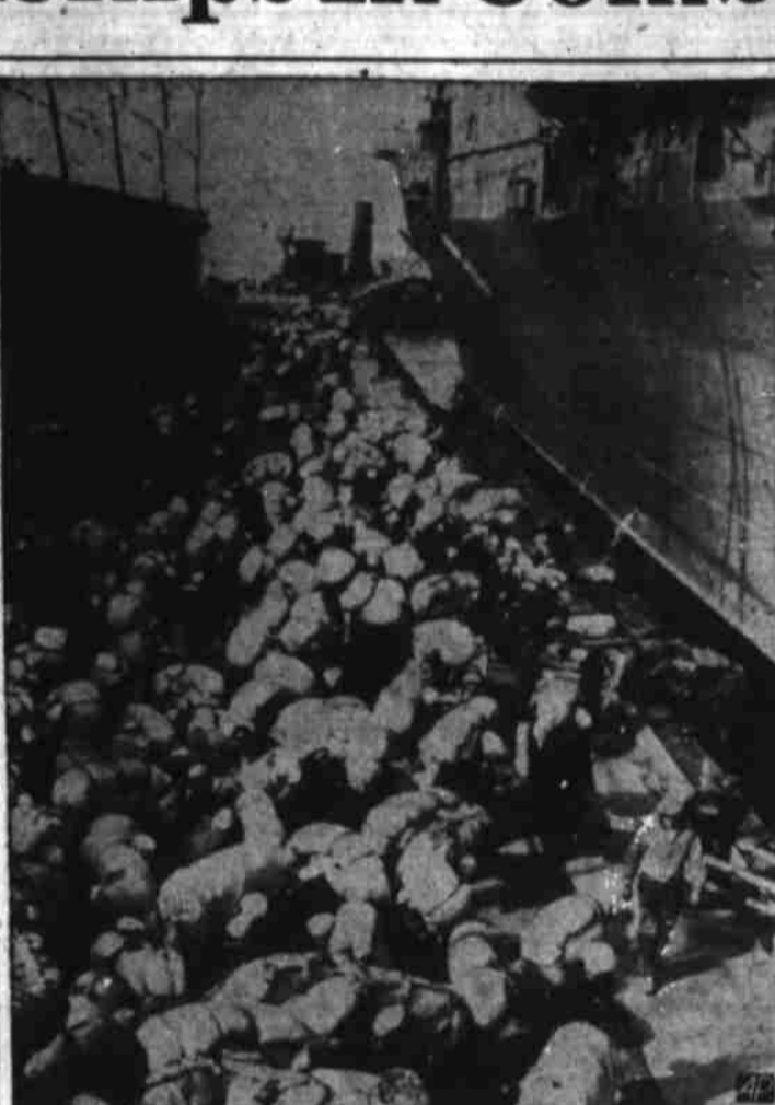
Sailors Board Hornet—Their duffel bags swung over their shoulders, sailors will man the navy's new aircraft carrier U. S. S. Hornet go aboard at the operating base at Norfolk, Va.