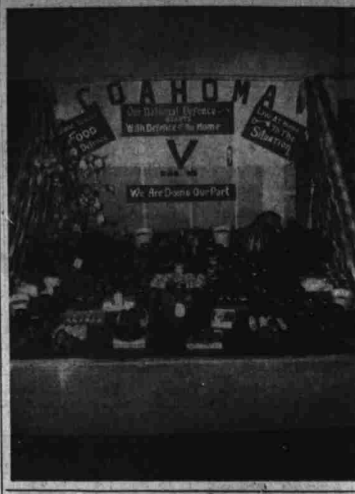
Photograph of the second place Coahoma exhibit booth.