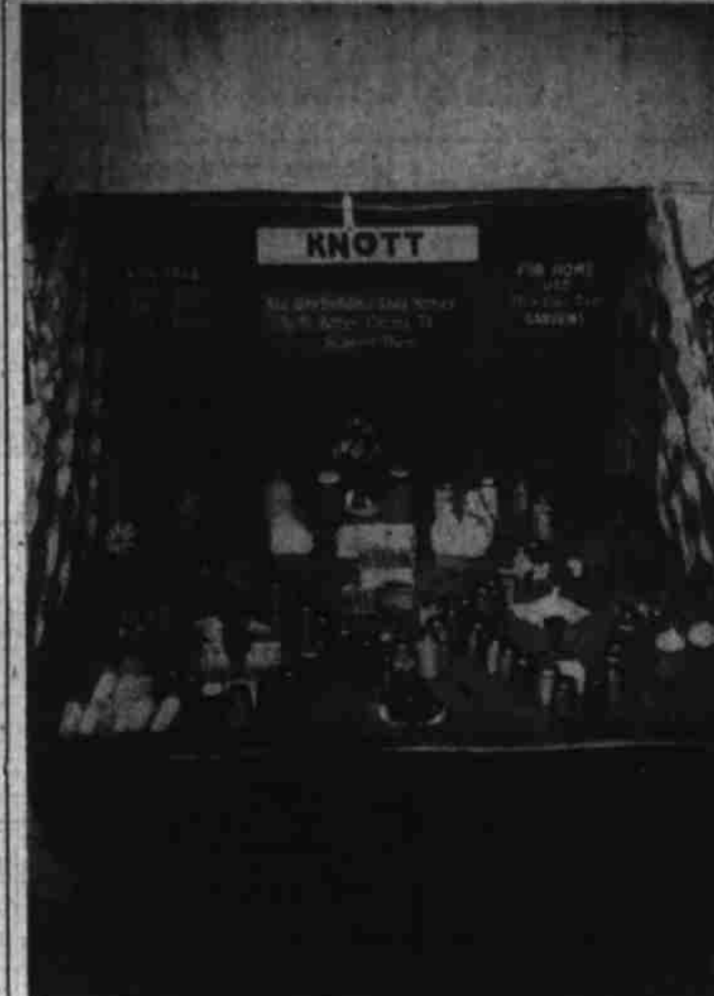
Photograph of the fourth place Knott booth exhibit.