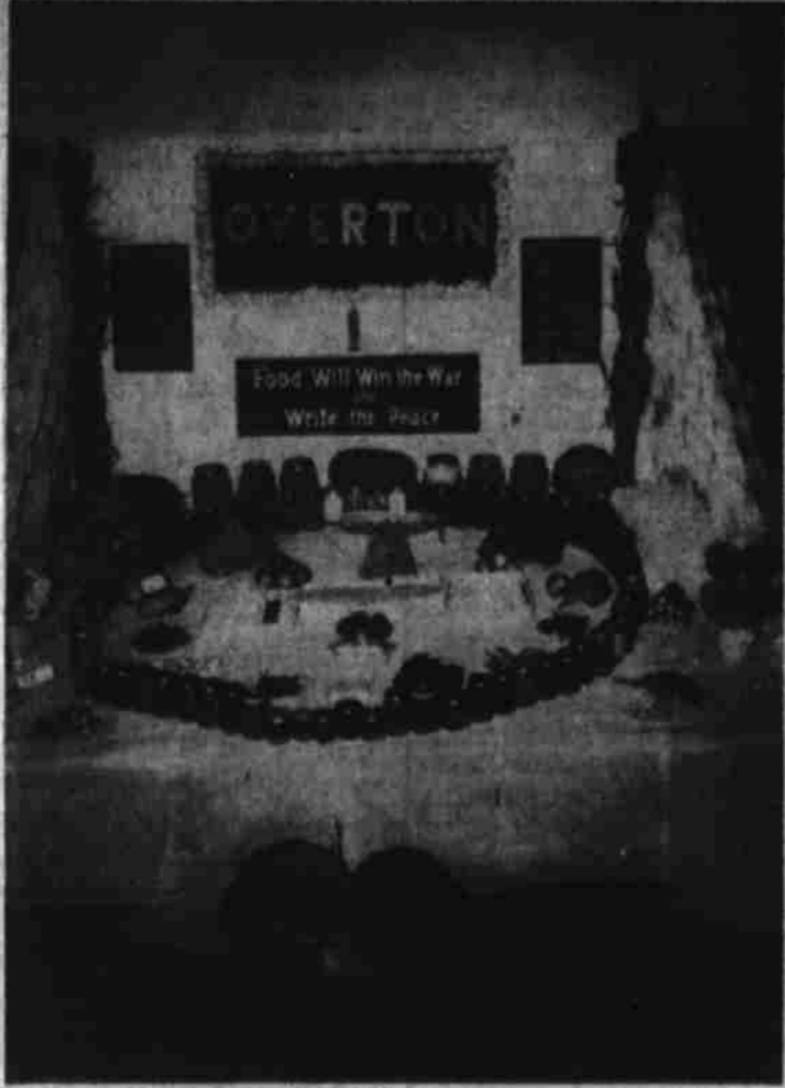
Winning Booths —In the Howard county products exhibit are pictured here. At left above is the first prize Overton booth; center above is shown the second place Coahoma exhibit; center, below, is the third place Midway display; and at the extreme right is the fourth place Knott booth.