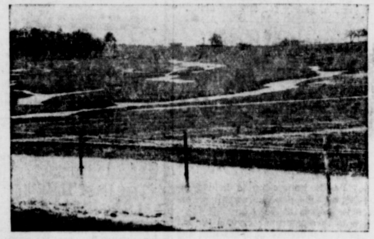
THE BAD —Overgrazed range without a protective grass cover retains only a small portion of intense rainfall and loses valuable topsoil in run-off. This condition is most common following severe drouth, when range plants do not have sufficient vigor to grow a protective cover.