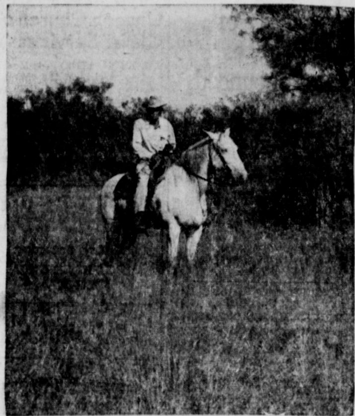
THE GOOD —A protective cover of grass such as this stand of side-oats grama will stop water run-off and soil loss. A good grass cover will hold winter moisture for growing more grass next summer.