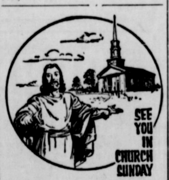
SEE YOU IN CHURCH SUNDAY

WASHINGTON, D. C. — The Commandant, U. S. Coast Guard, has announced that there are still openings avail- able in the Officer Candidate School class that will convene on September 15, 1963. Upon completion of 17 weeks training, graduates will be commissioned Ensign in the U. S. Coast Guard Reserve. College seniors and graduates may fulfill their military obli- gation thru the Coast Guard Officer Candidate School pro- gram. For further information, write Commandant (PTP-2), U. S. Coast Guard, Wash- ington, D. C.