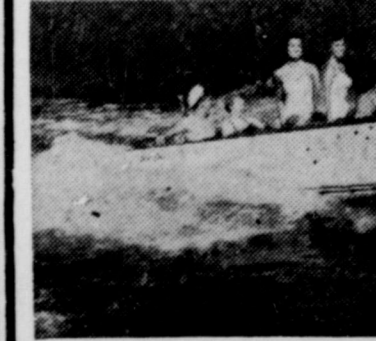
RAKISH STYLING OF 1955 LONE STAR BOATS is demonstrated by this fast, new 18-foot outboard sport model, the RIVIERA which is convertible with a canopy as a "cruisette". The new Lone Star outboard and inboard line includes 29 aluminum and Fiberglass models (flat bottom, semi-v and cruisers) as well as 5 boat trailers. Two-tone color styling, numerous design improvements and a wide selection of models from 9 to 21 feet are features of the popularly-priced Lone Star boat line. With formal introduction of the 1955 line at the New York and Chicago Boat Shows, the new Lone Stars will be on display at...