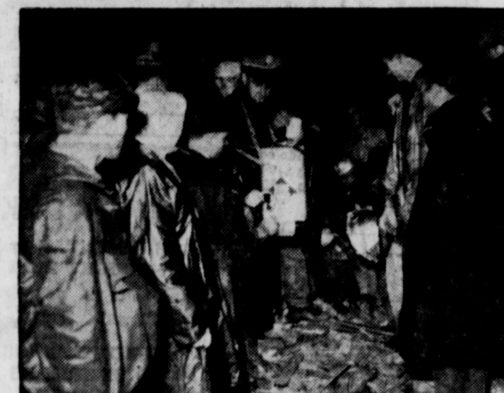
DISASTER SERVICE — When disaster strikes, the Salvation Army answers the need for help immediately. Food, clothing, shelter, and spiritual comfort are offered around the clock as long as the need continues. In Waco alone, where this picture was made, Salvation Army officers worked for fourteen days. Mobile canteens from throughout the state were rushed into service manned by a staff trained in disaster service. Wherever the disaster and whatever type it may be, the Salvation Army is ready to rush aid and comfort to the victims, and to meet the needs of those caught in disaster immediately and without red tape.