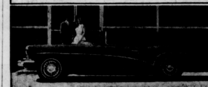
Buick's new Wildcat III, a flashy speedster built along sports car lines, will be exhibited in the Southwestern Automotive Exposition at the 1955 State Fair of Texas, Oct. 7-24.

Parakeet in Huntington Park, Calif., has a built-in suicide complex. Best thing he says when dying about uncaged is, "Here, kitty, kitty, kitty."