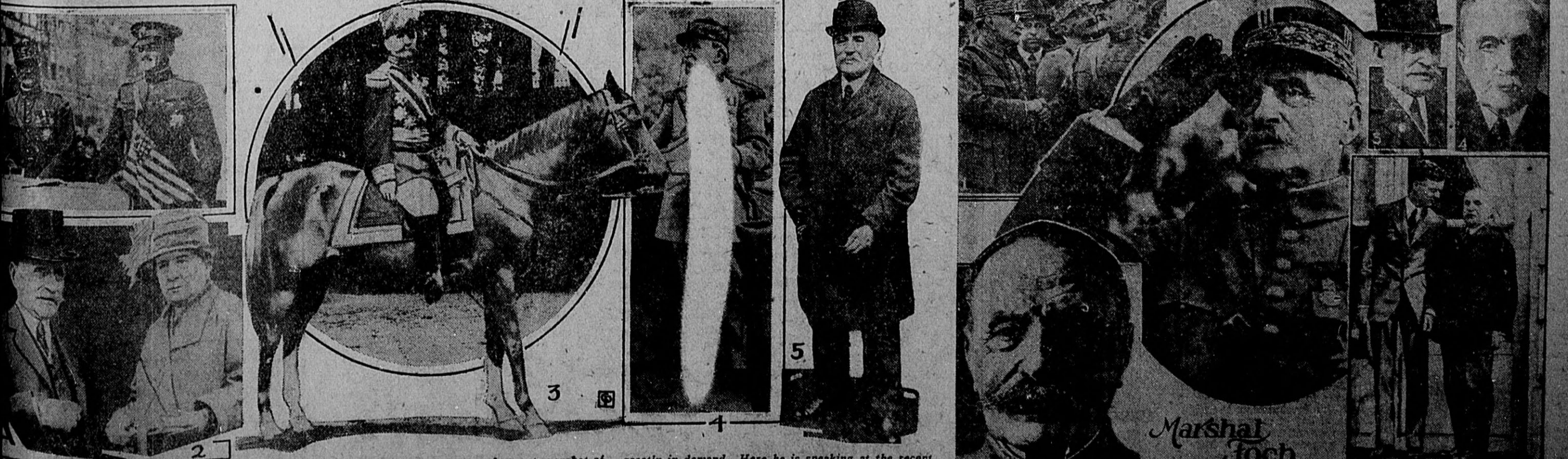
marshals into the life of Ferdinand Foch, marshal of France and commander-in-chief of the Allied armies during the closing days of the World war, stricken by a heart attack at his home in Paris, France. J. Foch in America, where great crowds hailed him as he rode in with Gen. John J. Pershing, American commander-in-chief. 2 Foch the sportsman. A recent snapshot of the veteran soldier and his wife at the Longchamps race track in France. 3. The war lord of all the Allies. Foch shown astride his steed while commanding troops during the war with the Germans. 4. As an orator, the white-haired, pleasant old war hero was greatly in demand. Here he is speaking at the recent dedication of the Nice, France, war memorial. 5. In retirement. Resting from his harrowing task of staving off defeat and destruction of his country during the war, Foch was ending his days in quiet and peace when illness overtook him.