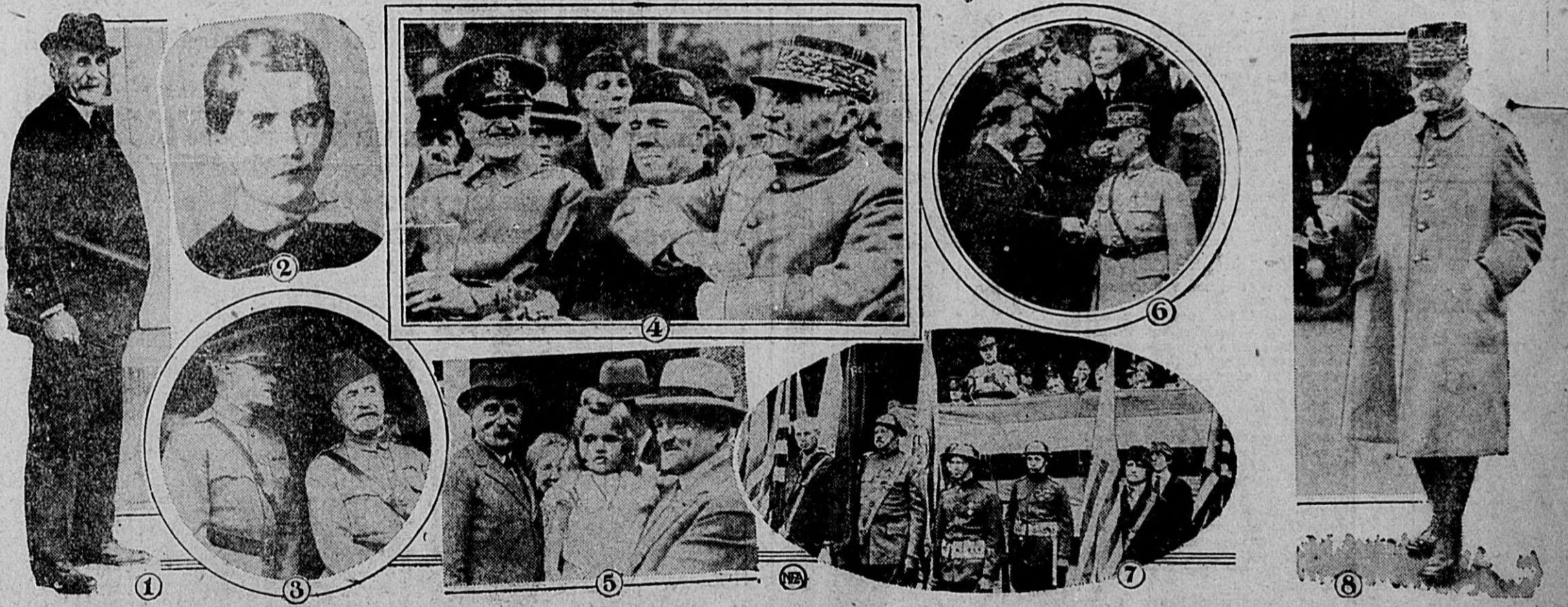
1—A recent photo of Marshal Foch, taken at an important military conference; 2—Foch as a schoolboy of 12 in Southern France; 3—Foch and Gen. Pershing on former's visit to New York; 4—Foch, Pershing and Howard W. Savage (center), American Legion commander, in Legion parade in Paris; 5—Foch and Pershing when latter visited his chateau in Brittany, Pershing holding Foch's little granddaughter; 6—Mayor Hylan greeting Foch on Lutter's triumphal visit to New York; 7—Foch (speaking) at memorial services for American dead at Suresnes cemetery, near Paris; 8—Foch at an Allied conference in 1921.