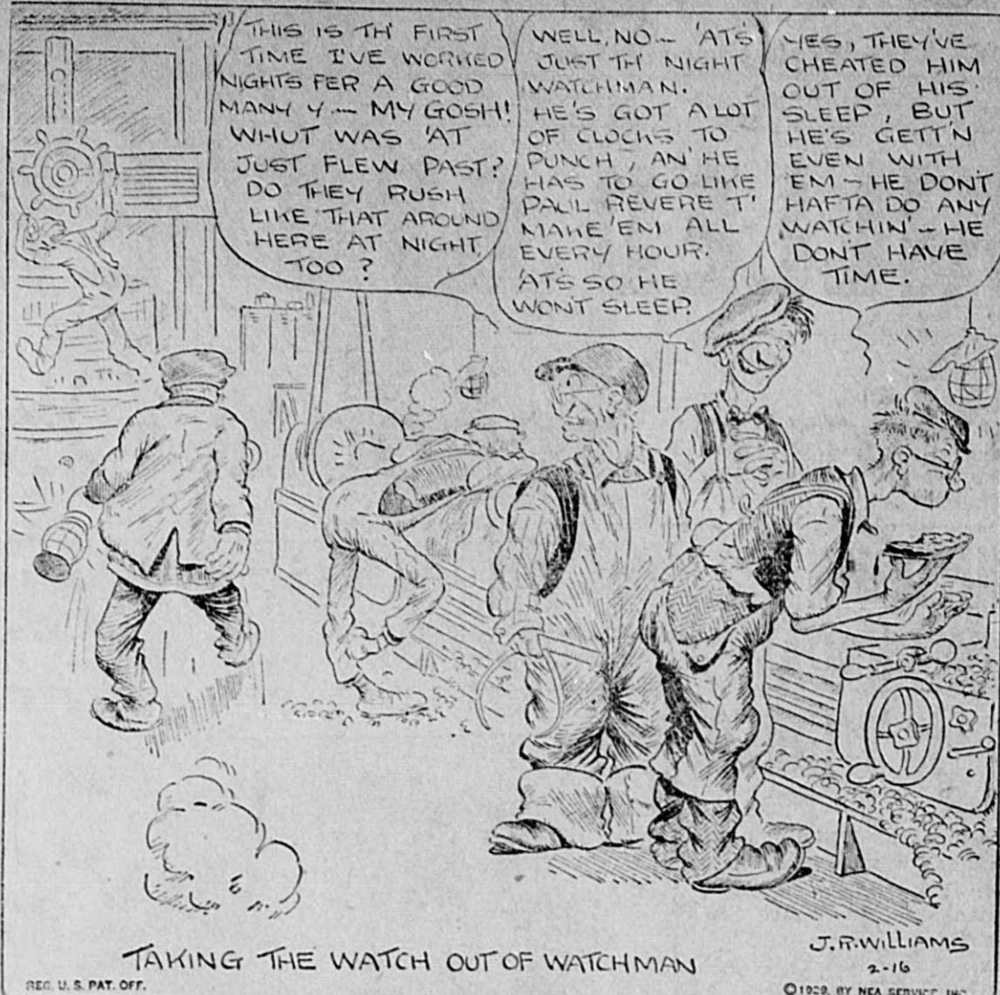
TAKING THE WATCH OUT OF WATCHMAN