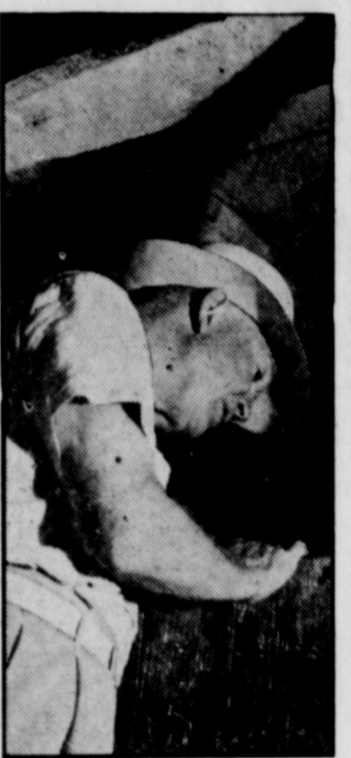
FARMER IKE —The President looks right at home as he checks his livestock in the barn of his Gettysburg estate.