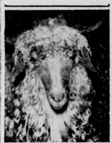
This blue-blooded Angora goat is regally representative of purebred champions who will be entered in livestock shows during the 1955 State Fair of Texas, Oct. 7-23. The fair will have classes for 28 breeds of beef and dairy cattle, horses and Shetland ponies, swine, sheep and goats.