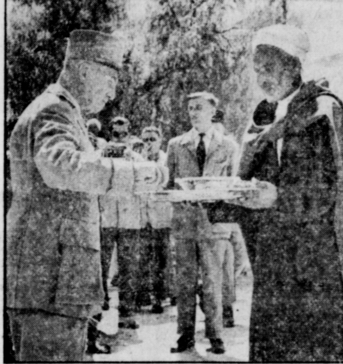
"DATE" WITH DESTINY—Gen. Pierre Boyer de Latour, newly appointed resident general of French Morocco, accepts the traditional Arabian offering of dates and milk as a sign of hospitality as he visits Oued Zem, scene of a recent bloody uprising of Berber tribesmen. He replaces Gilbert Grandval as France attempts to cool seething unrest in North Africa.

Clear to partly cloudy Tuesday and Wednesday with chance for widely scattered afternoon showers. High both days 90. Low Tuesday night 70.