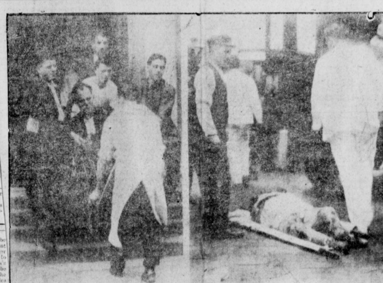
Graphic picture shows victims of the New York subway disaster brought up to the street and placed in waiting ambulances to be taken to hospitals or taken to undertaking parlors. Note the expression on the face of the man in the wheel chair on the left. One of his legs was crushed off when the subway train crashed. This photograph was taken by a cameraman for this newspaper and NEA service and rushed by telephoto.