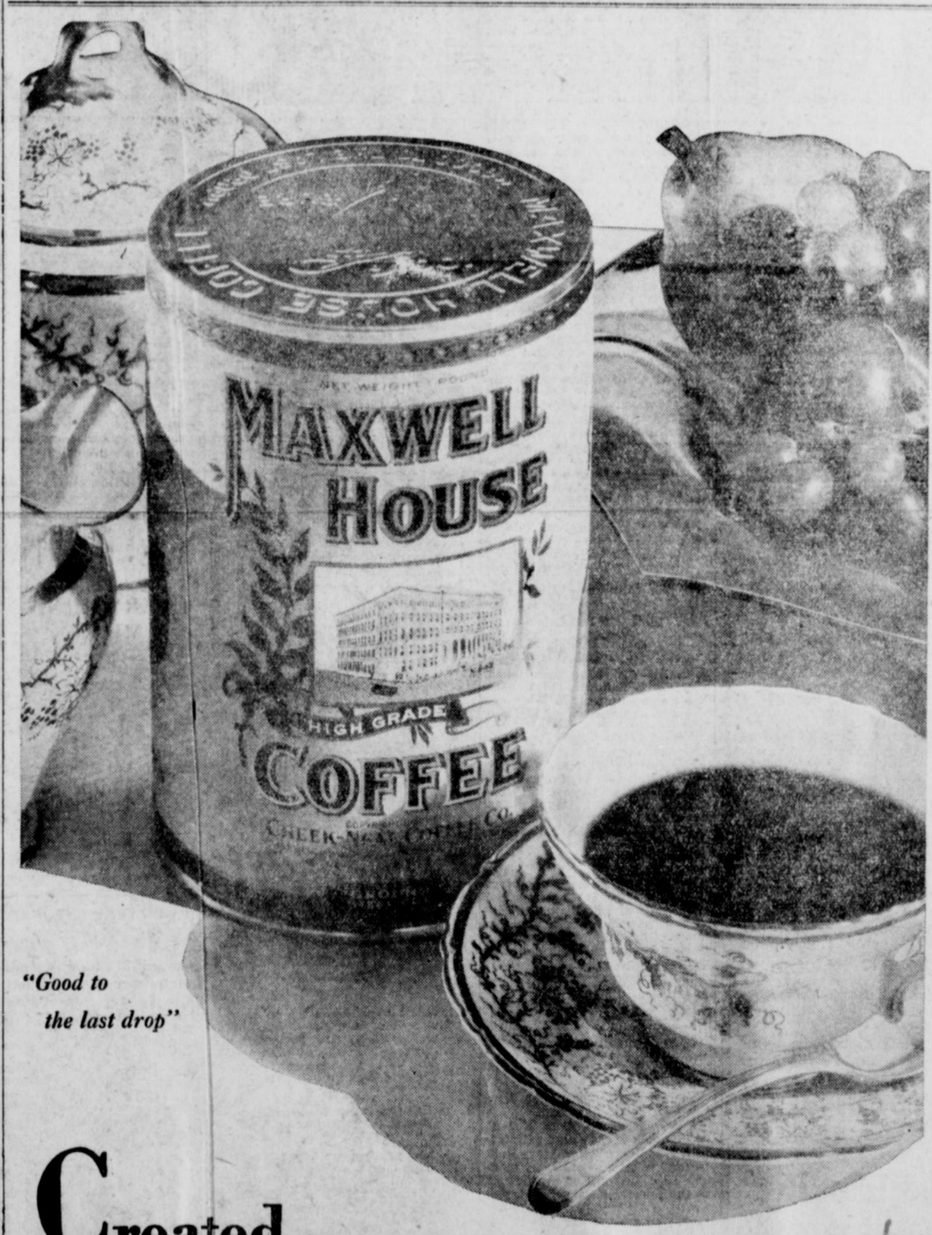
"Good to the last drop"

Created from many coffees.... this special blended richness