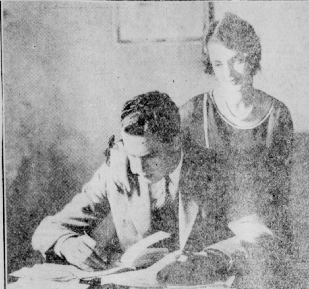
"Looks like we'll need a new budget," she said, striving to speak lightly.

WHAT HAPPENED Ward, on the eve of to Rod, Bryer, re- knife as a gift from who had turned Rod who was not weal- of the metal chil- and the thought dagger to pierce her shined across her mind dreaming anticipation miserably foreboding. reproachfully resolves not of Rod's past love future is in her keep-