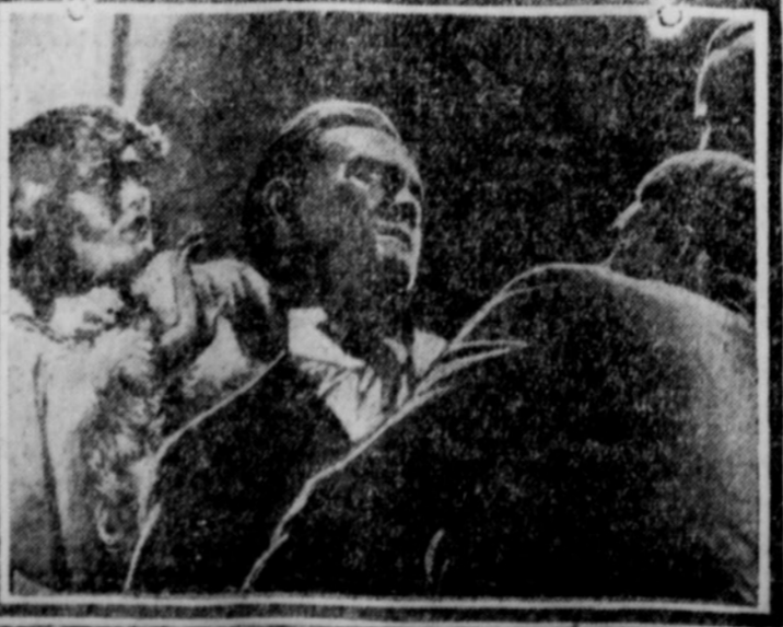
Scene from "Tenderloin" starring Dolores Costello with Conrad Nagel. A Marjorie Bros. Production