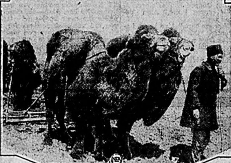
The camels are coming . . . to help Russian farming. Here you see "ships of the desert" being used as plow horses for tilling the fields on one of the Soviets' collective farms in the Orenburg region of Russia.

The writer offered to establish a bank of this kind to the Chamber of Commerce on a meeting in the fall of 1926, but he is convinced that the nature and extent of his remarks were entirely forgotten the following morning.