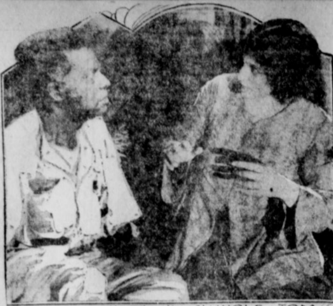
CASSIE learns the identity of "UNCLE TOM". Scene from "UNCLE TOM'S CABIN" A UNIVERSAL PICTURE