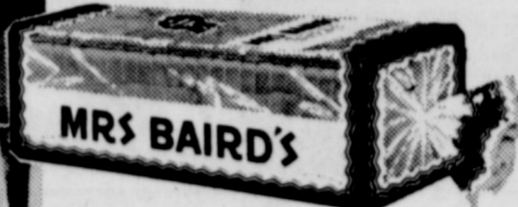
Today her family still uses that baking method... because they still care about quality.