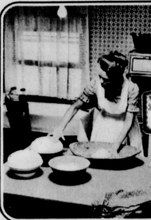
Mrs. Baird baked her bread the old-fashioned yeast-rising way for wonderful flavor and soft texture.