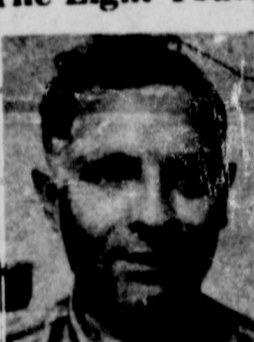
By Clint Bray

Wife, replacing phone, to husband: "A panel of impartial housewives has just canceled your poker game."