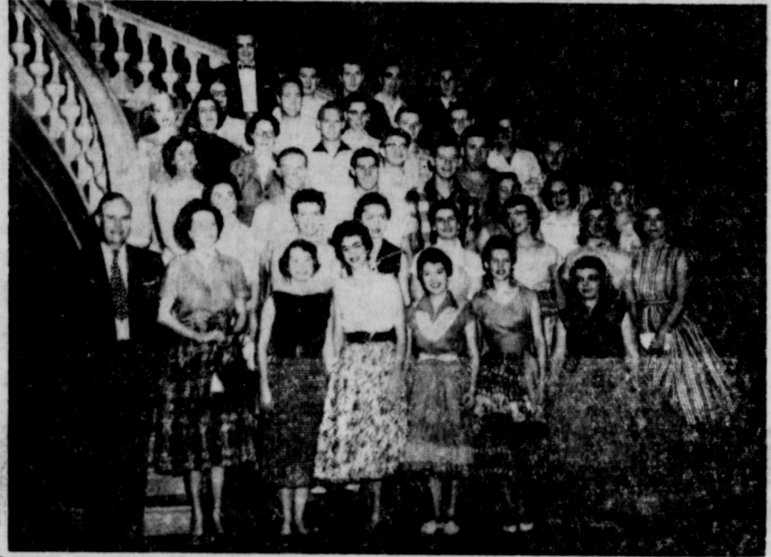
SOUTH OF THE BORDER —Students and faculty of Ranger Junior College who recently took an early vacation south of the border—down Mexico way, in Monterrey—pose for a Mexican photographer during their stay at one of the city's hotels. (See story inside).

That's about it for now. See you in church Sunday and back here again Tuesday.