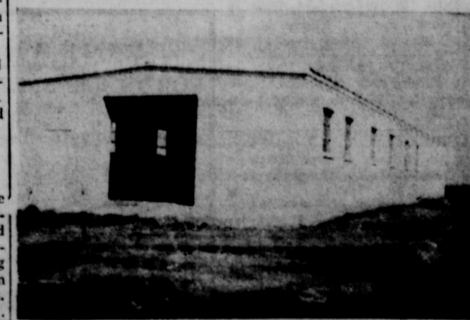
NEW AG BUILDING ON HIGH SCHOOL HILL

BE READY FOR HOT WEATHER. Have your auto air conditioner serviced and checked now. Otis Coleman's Humble Service Station, East Main St.