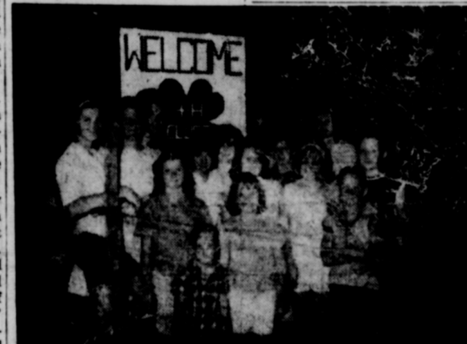
ERECTS 4-H ROAD SIGN — These 4-H Club members of the Morton Valley smile very proudly about their new 4-H road sign which they erected just beyond the "Y" on the Breckenridge highway. This is the first 4-H road sign to be erected by the Eastland County 4-H clubs.

The past is written! Close the book On pages sad and gay; Within the future do not look, But live today—today.