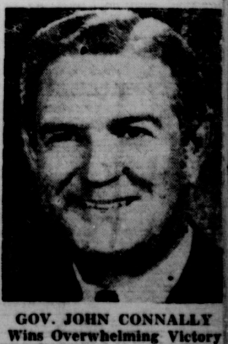
GOV. JOHN CONNALLY Wins Overwhelming Victory