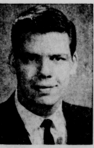
REP. WAYNE GIBBENS Scores Impressive Triumph