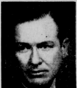
OMAR BURLESON ... Holds His Congress Seat

Cisco: Heyser 1,455. Eastland: Pierson 1,210. Ranger: Brown 720. VOTE TOTALS: Cisco 1,503, Eastland 1,272, Ranger 1,161. County total 5,931.