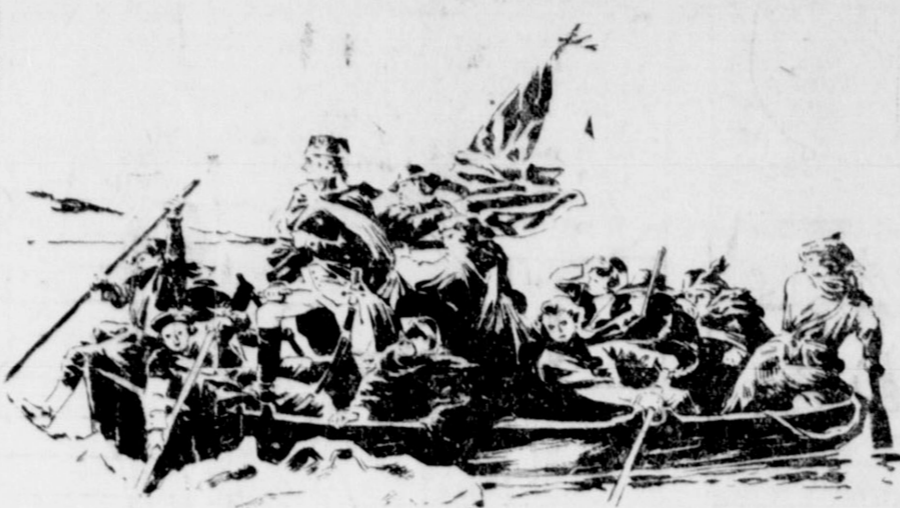
Washington crossing the Delaware.