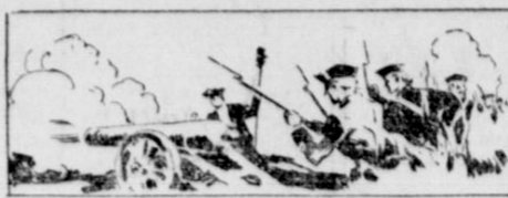
He forced the British out of Boston.