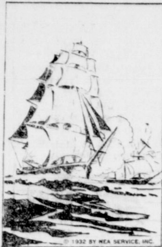
He encouraged privateers to attack British commerce.