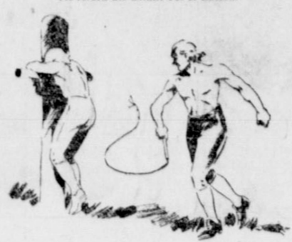
Deserters and plunderers were flogged.

By NEA Service. George Washington's genius in training raw recruits, his ability to rally Congress and obtain funds, munitions and provisions steeled the colonial army in good stead in the early, trying days of the revolution.