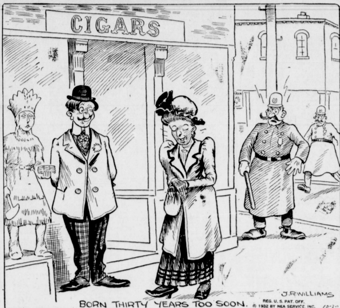
BORN THIRTY YEARS TOO SOON. REG. U. S. PAT. OFF.