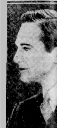
Manners are shown in pictures from First National...