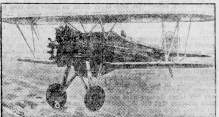
miliar with the personnel of the test flight in the United States before it was sold to the Chinese army

numbered 25, including heavy bombers and their fleet pursuit and battle planes.