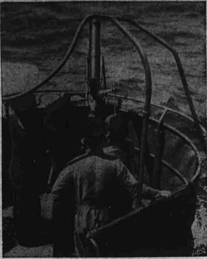
FAST WORK: The British crew tries out an American 50-calibre machine gun designed to fight low-flying airplanes. "The lend-lease ships bristle with these guns," Beatty writes. "The officers spent 10 minutes with the crew, and the sailors manned the gun as if they had been used to it all their lives."

I was to learn soon what this all meant, and to understand from what I saw how the Hood and