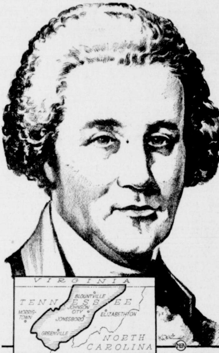
John Sevier, Indian fighter and revolutionary hero, sent as representative by North Carolina to the rebellious new "state" of Franklin and elected its governor. The map shows territory embraced in Franklin, now a part of Tennessee and North Carolina.

The western territory was again ceded to the federal government in 1790 and became known as Territory South of the Ohio until 1796, when the population became sufficiently large to form the state of Tennessee absorbing the lost state of Franklin, and electing John Sevier as its first governor.