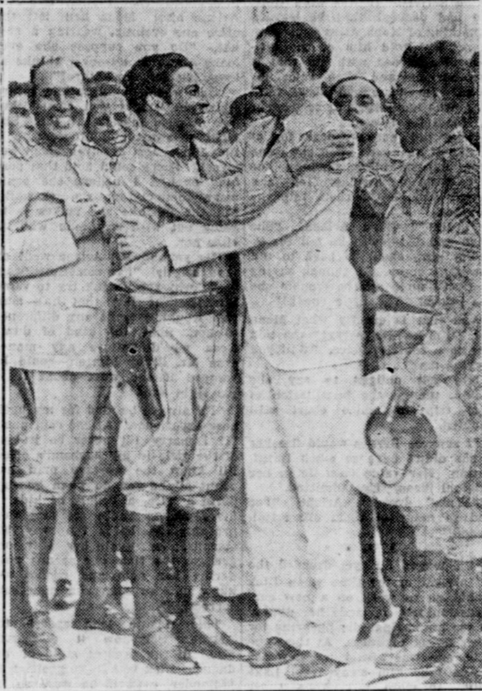
Exultant over their political and military triumphs, Dr. Ramon Grau San Martin (in white suit) and Col. Fulgenico Batista, new chief of staff of the Cuban army, embrace each other after the former's elevation to the presidency of the strife-torn island republic.