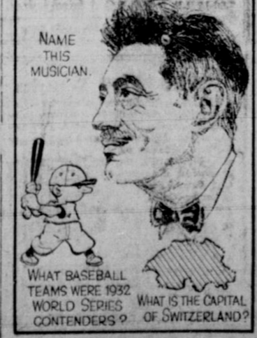
NAME THIS MUSICIAN. WHAT BASEBALL TEAMS WERE 1932 WORLD SERIES CONTENDERS? WHAT IS THE CAPITAL OF SWITZERLAND?