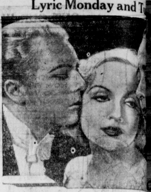
Gene Raymond, Carole Lombard and "Brief Moment" - A Columbia

"Shanghai Madness," the new Fox Film production, with Spencer Tracy in the stellar role, comes to the Lyric Theatre on Sunday to remain for an engagement of one day. It is a romance of white people against an ever-changing background of modern China.