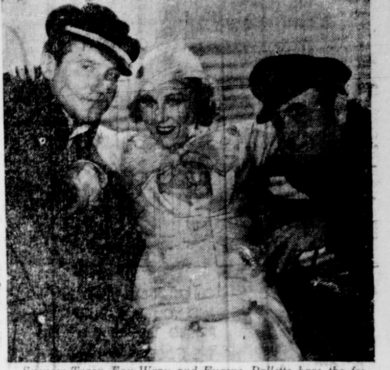
Spencer Tracy, Fay Wray and Eugene Palette have the featured roles in "Shanghai Madness," the new romance from the studios of Fox Film.