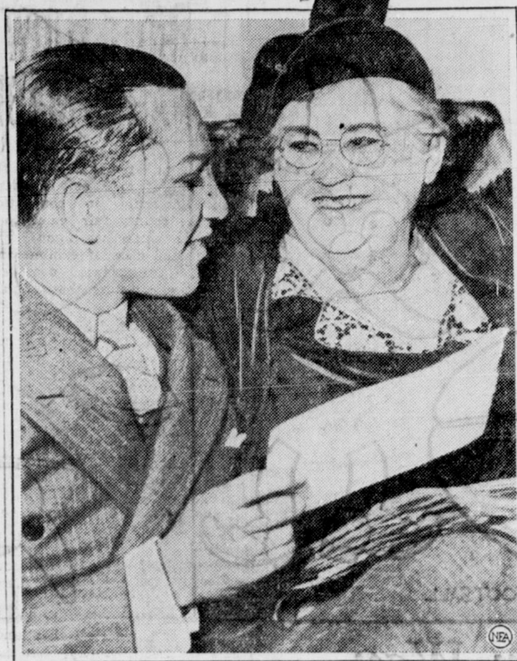
When Barney Ross took his $30,000 slice of the gate receipts at his recent fight with Tony Canzoneri...