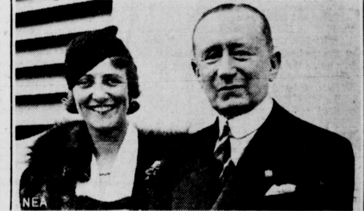
The Forecast's "Fair" for Guglielmo Marconi, famed Italian wireless inventor and his beautiful wife. For when this photo was taken on their arrival in New York, they were en route to the Chicago Exposition to attend "Marconi Day."