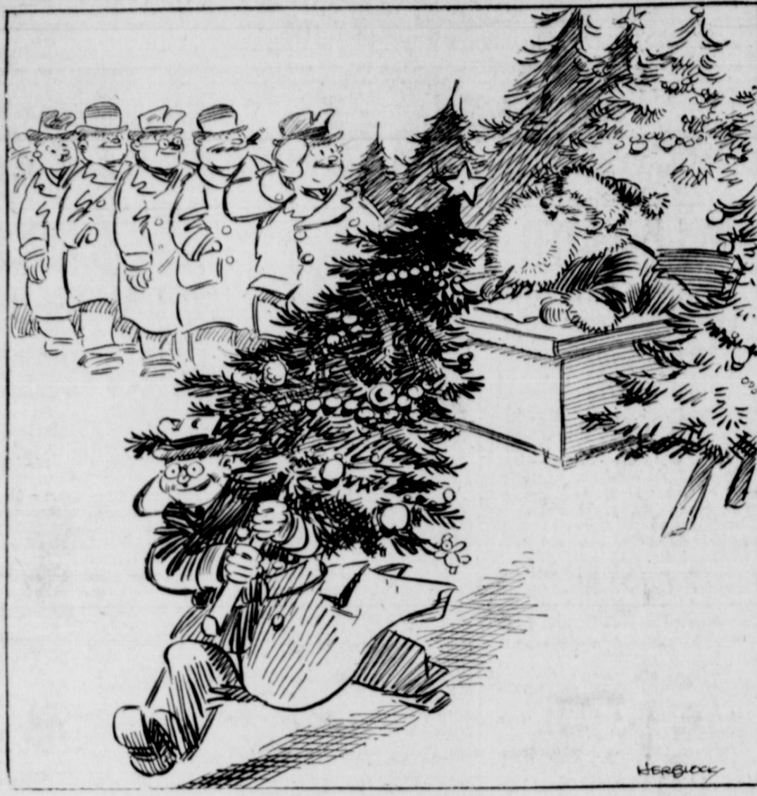
OUT OUR WAY