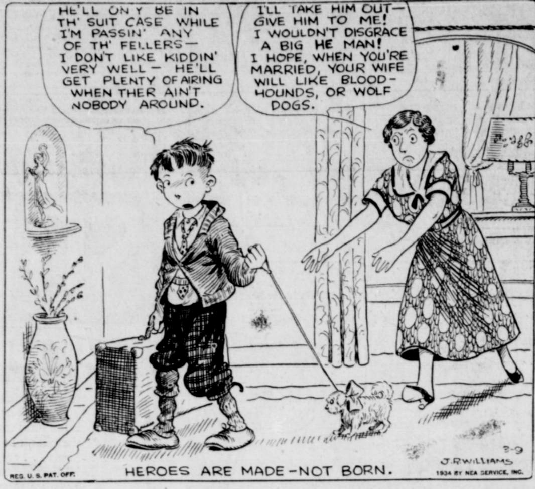
HEROES ARE MADE—NOT BORN.