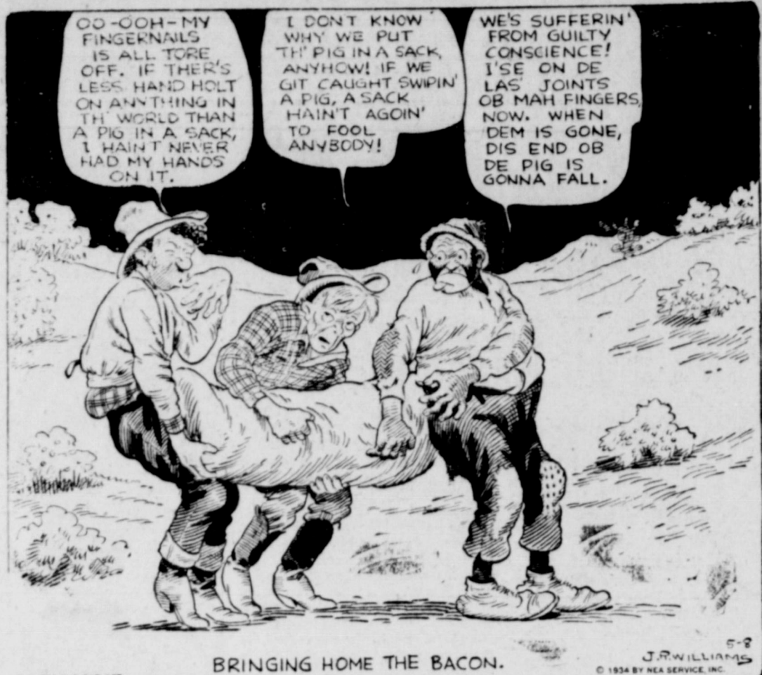
BRINGING HOME THE BACON.