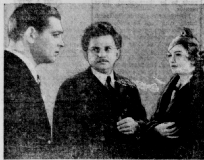
Clark Gable, Jean Hersholt, Myrna Loy in "Men in White"