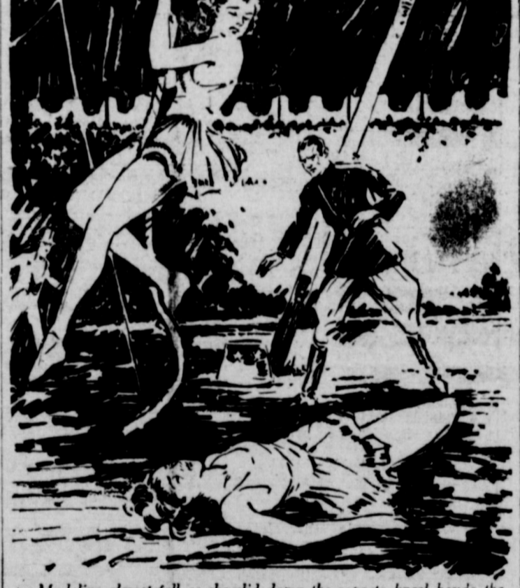
Madeline almost fell as she slid down the rope to kneel beside the crumpled, all-but-lifeless little figure.