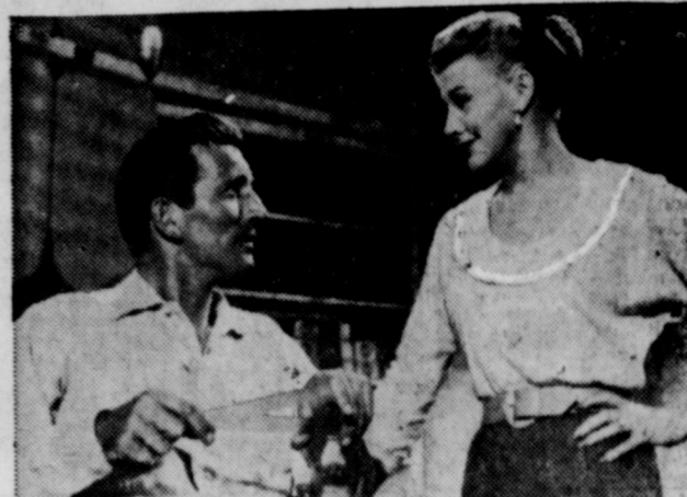
MICHAEL RENNIE and GINGER ROGERS in a scene from the 20th Century-Fox picture "TEENAGE REBEL" CinemaScope.

This is a story of an American Family—Not Juvenile Delinquents