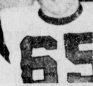
TOMMY McCULLOUGH ... offensive guard