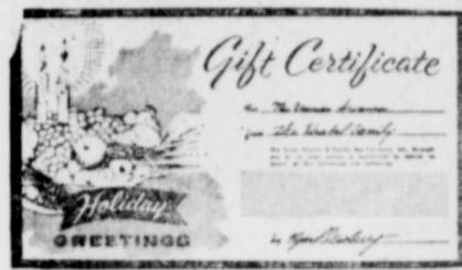
Available now at your A&P Store.

"SUPER-RIGHT" SMOKED DRY CURE HAMS Whole or Shank Half lb 59¢ Center Portion lb 99¢ SHANK PORTION LB. 43¢