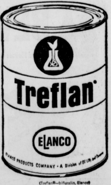
(Treflan—trifluralin, Elanco) Elanco Products Company A Division of Eli Lilly and Company Indianapolis, Indiana