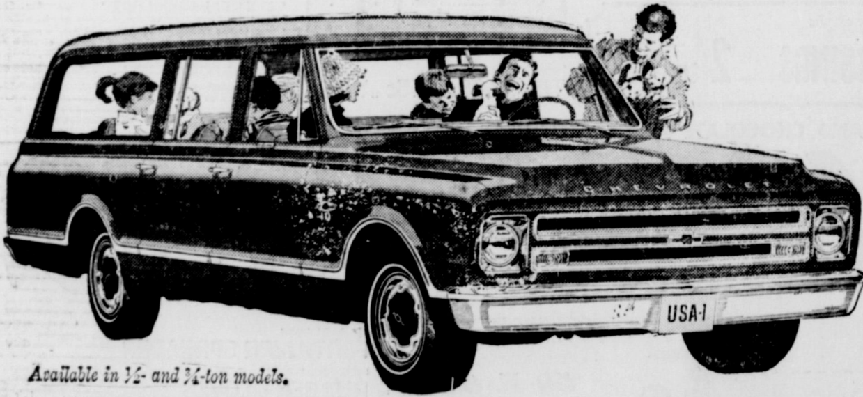
Available in 1/2- and 3/4-ton models.

The look, the ride of a station wagon, plus a tough truck chassis!