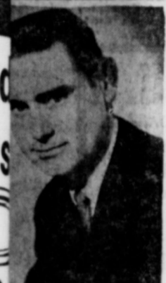
GEORGE JONES "White Lightning"

FOR 65 YEARS WE'VE BEEN BUILDING ANNIVERSARY SPECIALS! THESE ARE OUR BEST EVER!