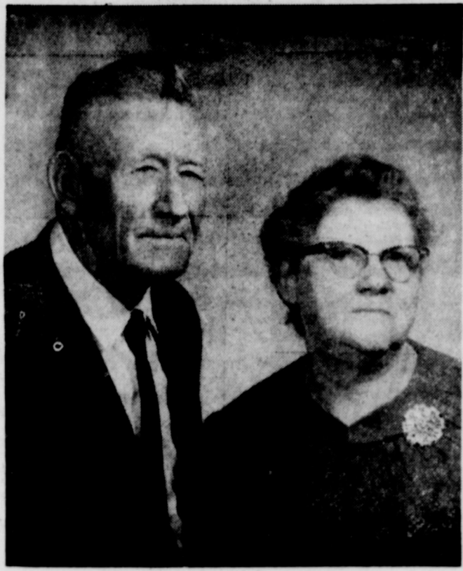
MR. AND MRS. R. J. PHARR

Tornadoes cause destruction with violent winds which uproot trees, destroy buildings, and which create a serious hazard from objects blown through the air; and by differences in air pressure which can cause buildings to collapse.