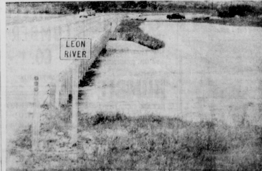
NO CAPTION NEEDED!