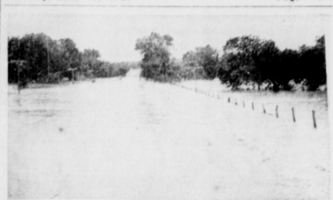
THE LEON RIVER, three miles south on Cisco, was at a record flood stage when this picture was made at 10 a. m. Monday. Highway 183, shown here, was closed to traffic for several hours.