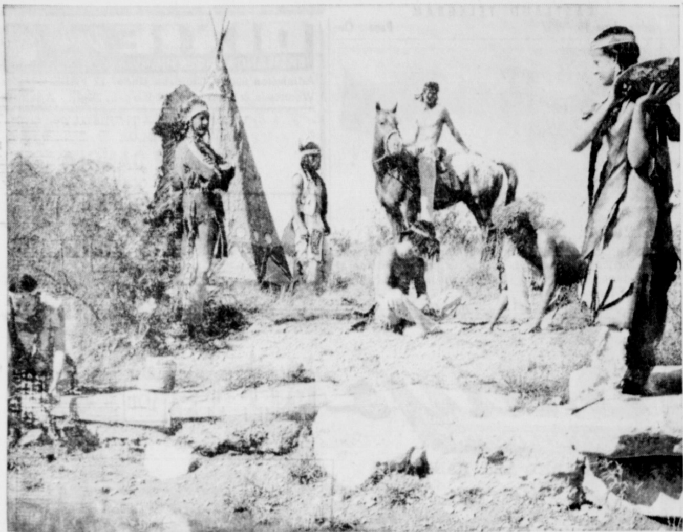
JUST OVER 100 years ago the broad prairies surrounding Albany, Texas, were the home of bands of Comanche, Kiowa, Apache, Tonkawa and Kickapoo Indians. The Fort Griffin Fandangle depicts the Indians as they must have been before the white man came. The carefully authentic sets and Indian attire were designed and made in Albany, as were all props and costumes belonging to the musical historical production scheduled for June 15, 16, 17 - 22, 23, 24.