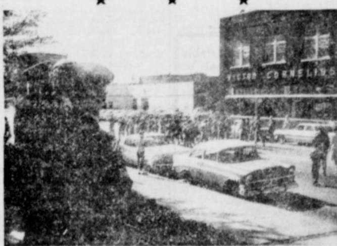
The Band leads the parade down Main St. with officers and dignitaries on the reviewing stand.