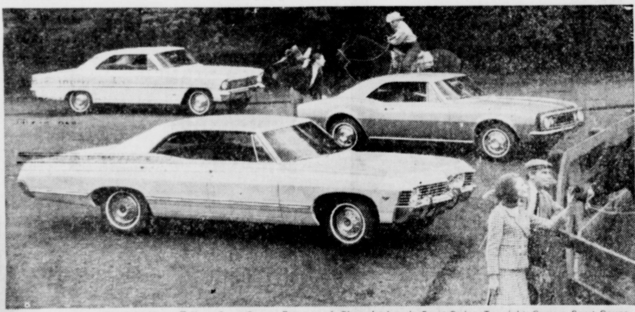
Top left: Chevy II Nova Sport Coupe. Foreground: Chevrolet Impala Sport Sedan. Top right: Camaro Sport Coupe.