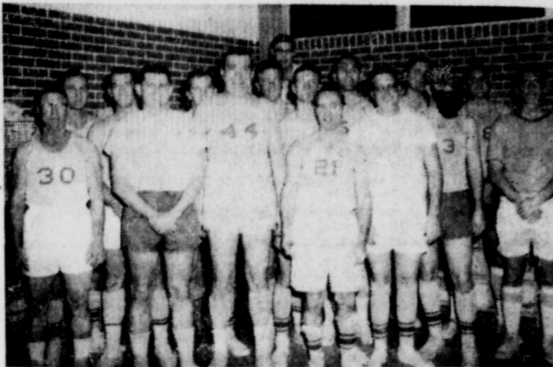
THE 1967 EASTLAND Misfits played the Harlem Stars. Some of them will play at the high school gym Friday, Jan. 5, when the Stars return to Eastland.