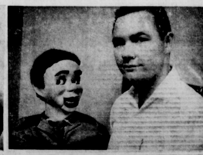
"Now Doesn't That Look Good?"

Shop in EASTLAND Monday -- It's Another Dollar Day!