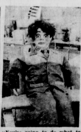
::You're going to do what to