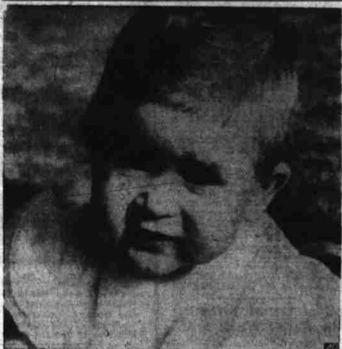
THE PRINCE IS INTERESTED — Chubby-faced Prince Charles, eight-month-old son of Princess Elizabeth of England and the Duke of Edinburgh, is just as interested in the camera as the camera is in him during play on the lawn of Windlesham Moor, summer residence of his parents. This informal photograph of the Prince is from a British newsreel.