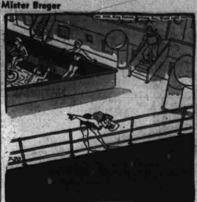
"No, no, dear—the ship's pool is on THIS side!"

LEGAL NOTICE THE STATE OF TEXAS COUNTY OF HOWARD NOTICE TO CREDITORS