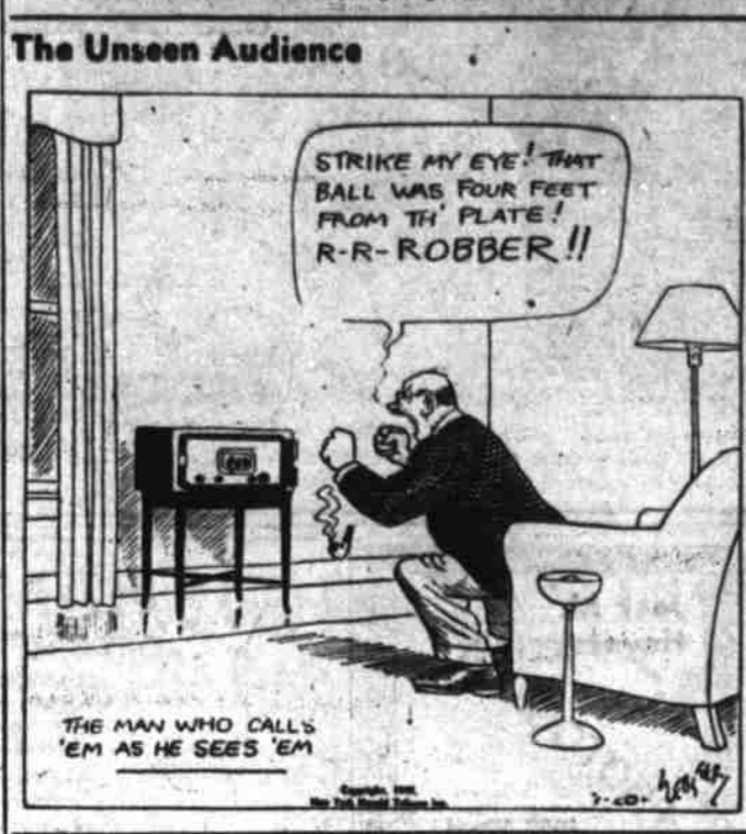
THE MAN WHO CALLS 'EM AS HE SEES 'EM

LEGAL NOTICE THE STATE OF TEXAS COUNTY OF HOWARD NOTICE TO CREDITORS