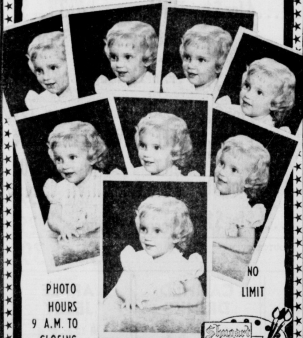
PHOTO HOURS 9 A.M. TO CLOSING

8 99¢ KING SIZE WALLET CREATIVE COLOR PORTRAITS FOR ONLY